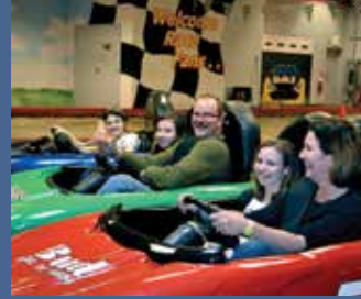
Enchanted Castle Restaurant & Entertainment Complex